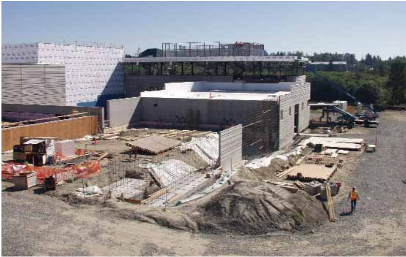
General contractor for the Berlex, a pharmaceutical manufacturing plant in Lynnwood, is Skanska USA Building Inc., Seattle.