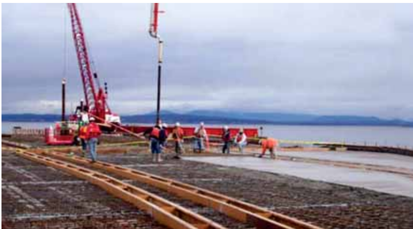
Hoffman Construction, is the general contractor. On the Port of Everett project.

which has options for another 50 planes. Those sales make it the fastest selling new airliner model Boieng has ever marketed.