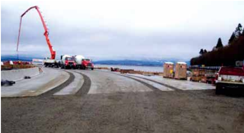
Work at the Port of Everett includes pier maintenance and repair, as well as construction of a mixed use project.