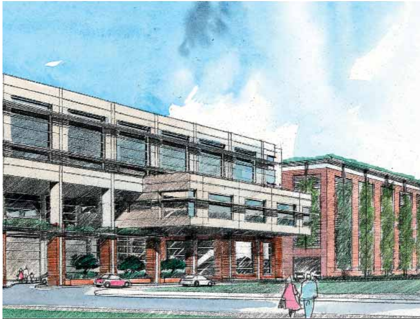
The Port of Everett is planning a major expansion with condos and retail space.

midst of major economic growth on all fronts, from building Boeing airliners and expanding highways to adding hundreds of homes and opening major new shopping centers.