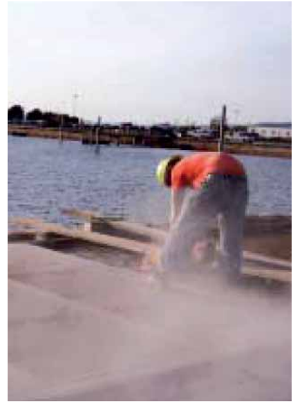
Wharf improvements are part of the Port of Everett plans.

• Multi-purpose rooms to meet the high demand for community events.