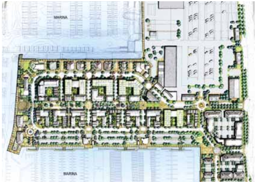
The layout for the Port projects includes several uses and will revitalize the waterfront area.

on the Gateway Shopping Center, anchored by a 255,000-square-foot Kohl's department store and a WinCo Foods supermarket on the 34-acre site. Farther north in Marysville, at the Smokey Point interchange on I-5, development is well along on the 476,000-square-foot Lakewood Crossing regional shopping center, focused around Costco and a Target store plus dozens of restaurants and other retail outlets.